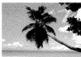
Picture of the beach where the camera was lost.